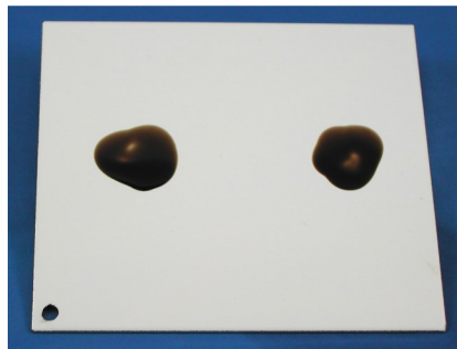
Figure 3: Dirty motor oil is applied to dried panel. Untreated (left) and treated (right).