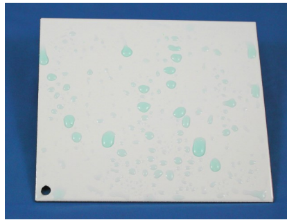
Figure 1: Untreated panel exhibits hydrophobic nature.