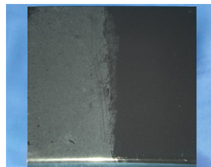
Figure 3: After 10 soiling/rinsing cycles, the right side of the tile is still hydrophilic and is a barrier to soap scum buildup and hard water spotting. The untreated left side allows soap scum buildup and hard water spotting.