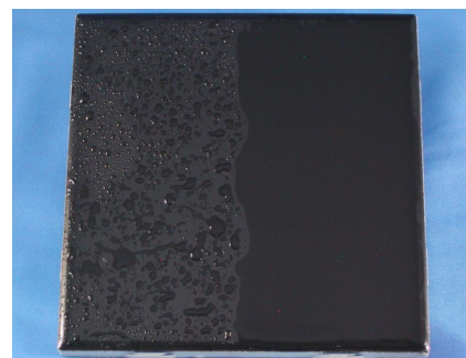
Figure 2: Right half of tile treated with 0.5% Flexipel SR-80 exhibits complete hydrophilization.