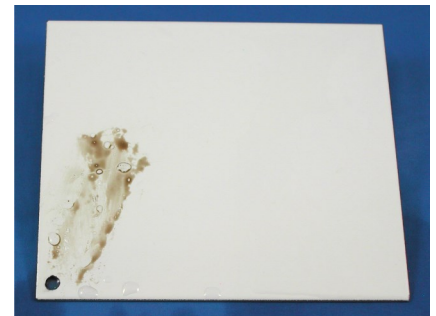
Figure 4: After rinsing, the hydrophilic right side of the panel readily releases soil.

This information relates only to the specific material referred to herein and not to its use in combination with any other material or in any process, unless explicitly stated herein. Such information is, to the best of our knowledge and belief, accurate and reliable as of the date compiled; however, no warranty, guarantee or other representation is made as to its accuracy, reliability, or completeness, or regarding any liabilities arising from others' patent rights. 20220421