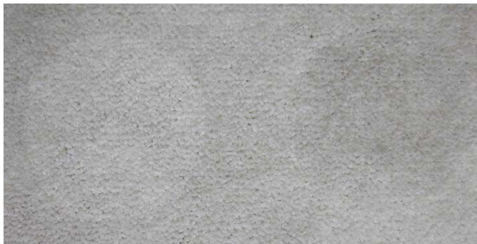
Flexiclean CC-560G Extraction Cleaner

26 oz. cut pile, nylon 6,6 tenth gauge, carpet squares (free of any prior dye or stain protection treatments) were used in this evaluation.